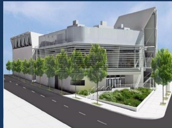
MTA: Bus Command Center Ground up – ($9,555,000) Bid Awarded 2015.