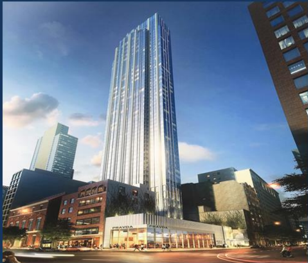
15 East 30th Street – Bid, Ground Up 213 Unit Complex, 6000 Amp Distribution Service with Fire Alarm and ARCS Systems and 800KW Emergency Generator System.