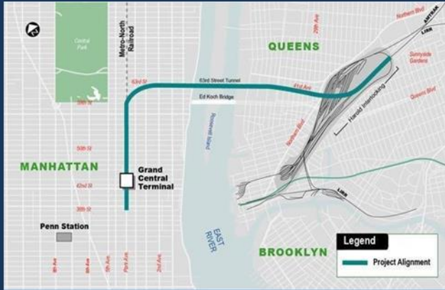
MTA East Side Access 44th and 50th Street Ventilation Facility Plant: Bid and Awarded ($9,500,000.00) 2016.